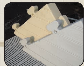
Other colors available upon special request.