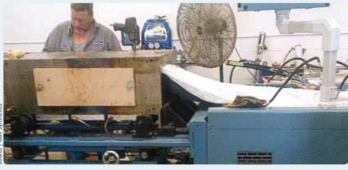
5 MPG included two removable inserts in the Gulf die to allow for different wall thicknesses. When competing against a lower cost resin like PVC, the inserts can be switched out to produce a thinner profile. At the exit end of the die, a cooling zone is required to act as a heat sink. It's not uncommon for MPG to see heat zones between 425°F/218°C and 450°F/232°C through the die. The cooling zone can drop the temperature by as much as 125°F/52°C.