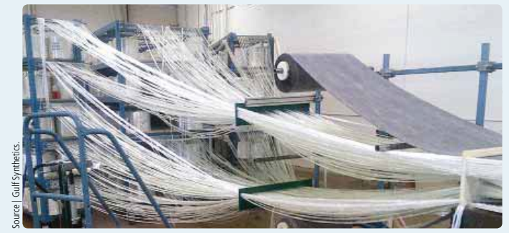
Approximately 900 ends of the heaviest weight roving (56 yield) flow into Gulf's sheet pile. Also incorporated are two layers of biaxial stitched fabric, one on the bottom and one on the top. The resulting pultrusion has a glass loading of approximately 78 percent by weight. High glass loading is typical for PU pultrusions and can range from 75 to 80 percent by weight.