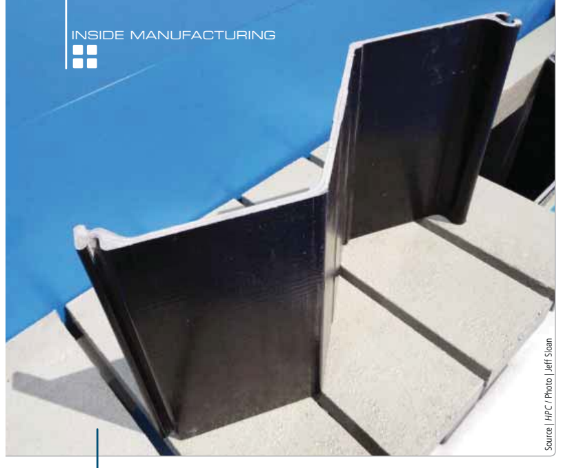
I The PURIoc sheet pile system uses a series of corrugated, interlocking piles to form a watertight wall. Each sheet pile profile is Z-shaped with a depth section of 8.5 inches/216 mm, a wall thickness of 0.25 in/6.35 mm and a width of 18 inches/457 mm (length depends on application).

"The geometries ... inside these injector sections often must be ground or EDM'd as separate inserts to allow for the complex geometries," he notes. "Most often, the parting lines in the injectors will match the die itself, which makes the system very user friendly for the operator."